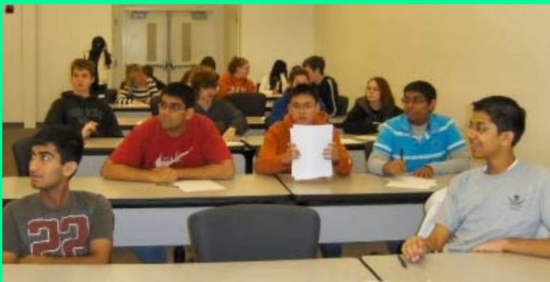
Students prepare for the competition. See more pictures HERE